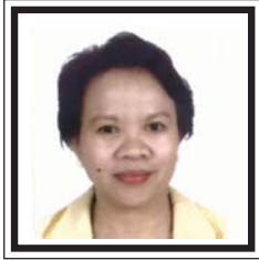
Nenalyn P. Defensor Commissioner